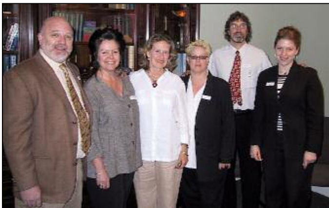
Wawarsing.Net Magazine • 2005 June