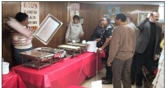
Below, breakfast is served at the Shiloh Baptist Church's Deaconess Ministry Prayer Breakfast on March 12 th .