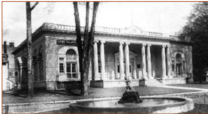
A photo of the Hunt Memorial Building during its early years. Note the Home National Bank sign, no steps to the far right balcony, the balustrade and flagpole on the roof, and a fountain that is neither the "Boy with the Boot" nor the swan.

Memberships start at $10 per calendar year for individuals, $25 for a family membership and on through