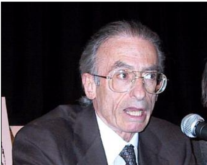
Wawarsing.Net Magazine • 2003 June